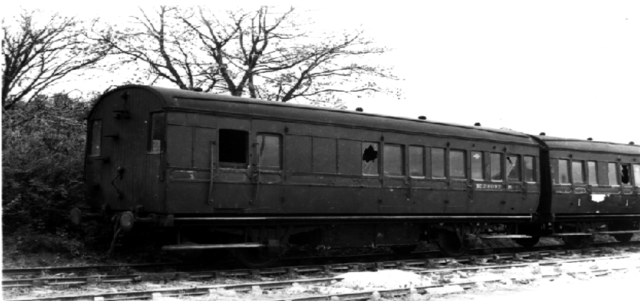
Brake Third number SC26092M derelict at Juniper Green on 20th April 1952.

One coach, BT number 26085, was photographed at St. Rollox in 1947 (A.G. Ellis collection number 1996 and H.M.R.S. collection number V2524). It is in L.M.S. livery with simple lining and in this case it has lost its central footboard. Photographs of condemned stock at Juniper Green on 20th April 1952