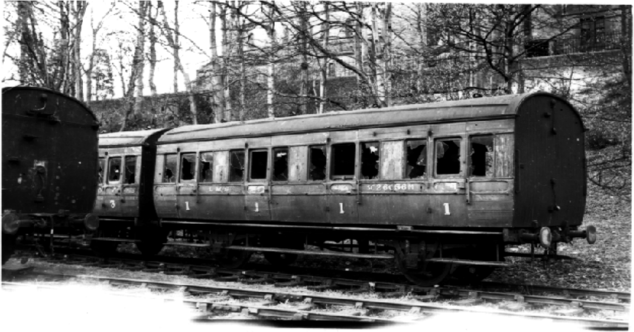
First number SC26056M (but still bearing the designation LMS) at Juniper Green on 20th April 1952.

A.G. Ellis Collection, Negative Number 7456