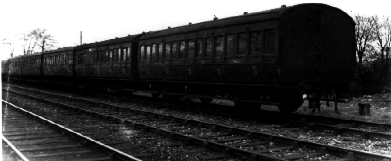
An unknown Full Third heads a rather dejected looking rake probably at Juniper Green.

Soon after its inception the L.M.S. adopted the old Midland colour of crimson-lake for its coach livery. All raised beadings were painted black and edged in a \frac{3}{8} " pale yellow line edged