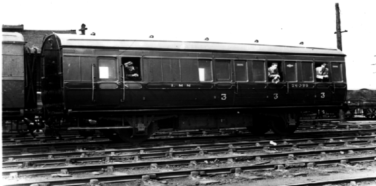
Brake Third number 26085 at St. Rollox in 1947

A.G. Ellis Collection, Negative Number 1996